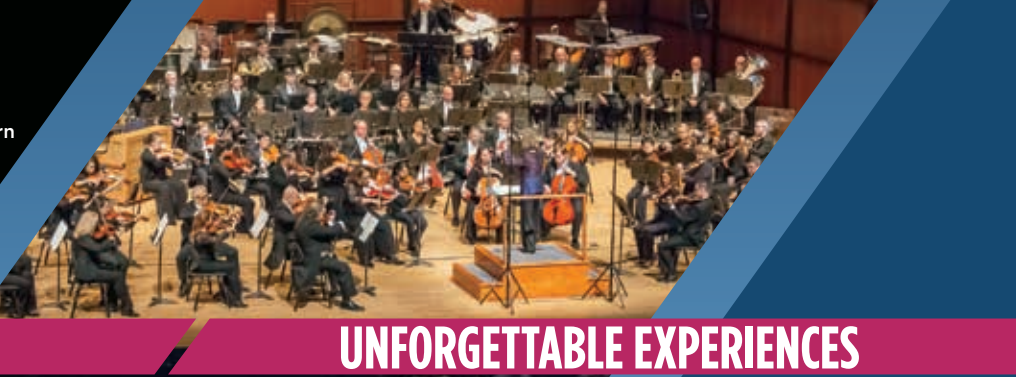
Virginia Symphony Orchestra