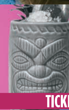
Leonard Bernstein's Trouble in Tahiti