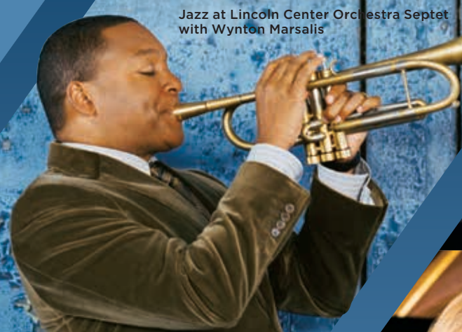
Jazz at Lincoln Center Orchestra Septet with Wynton Marsalis