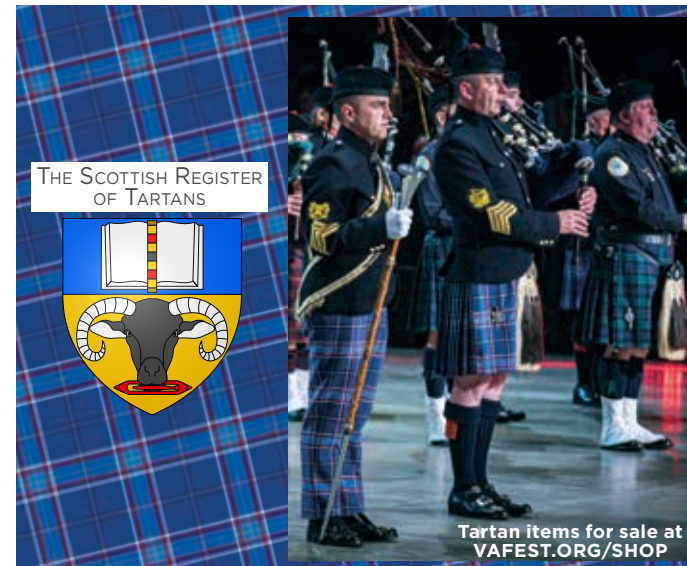
Tartan items for sale at VAFEST.ORG/SHOP

The Virginia International Tattoo Hixon Tartan perfectly demonstrates the rich heritage the Tattoo celebrates and the great state in which it resides. The dominant "Festival Blue" embodies the Virginia Arts Festival and pays tribute to those who bring the arts to life. The red, white and blue threads intricately woven throughout the tartan symbolize the patriotic themes and the heart-stirring performances synonymous with the Tattoo. The Virginia Flag and the Norfolk Seal are represented by the blue hues interlacing the tartan. And the grey stripes remind us of the massive grey hulls that guard our harbor and the mighty jets whose presence overhead keep us ever mindful of the men and women who sacrifice for our freedom.